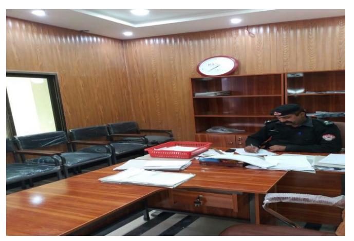
Community Policing room